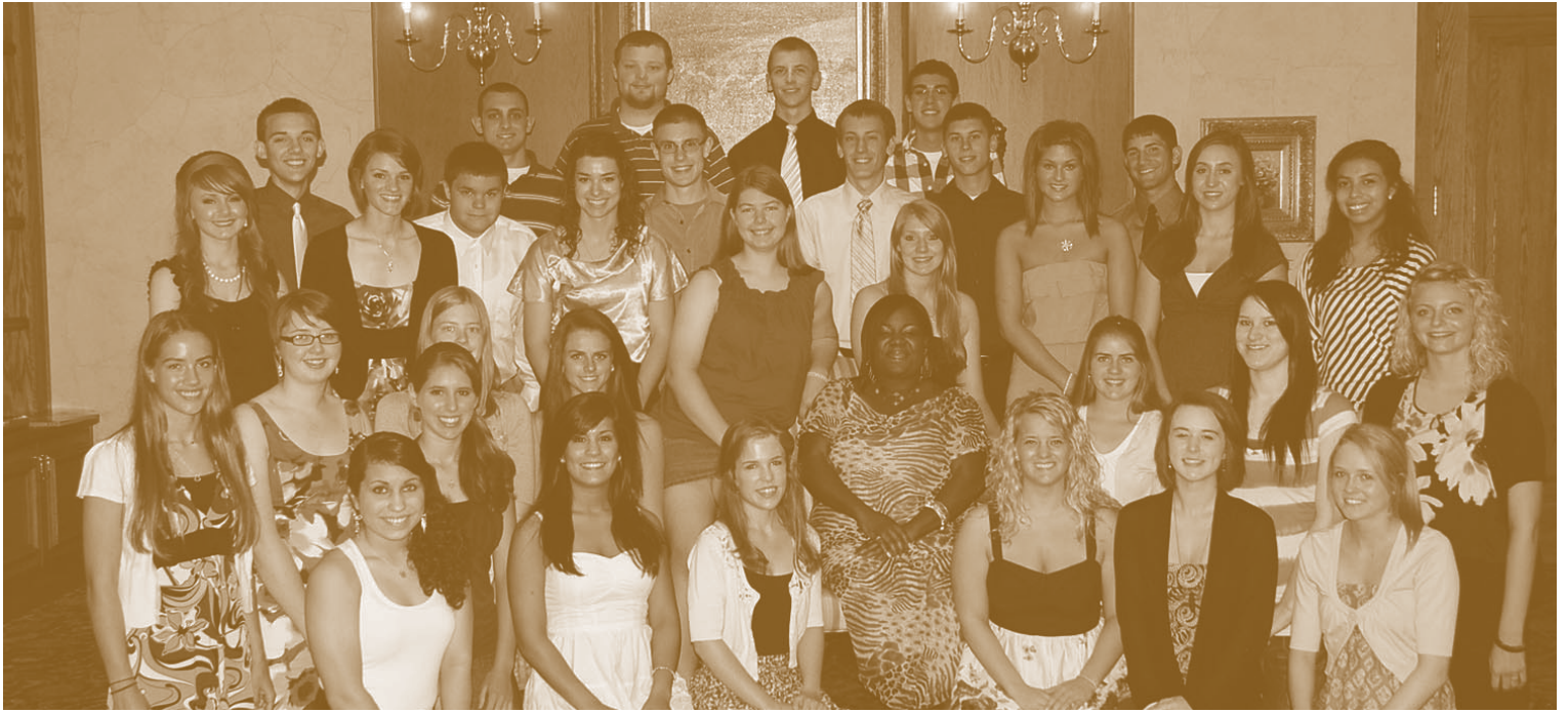
Community Foundation of Howard County Scholarship Recipients