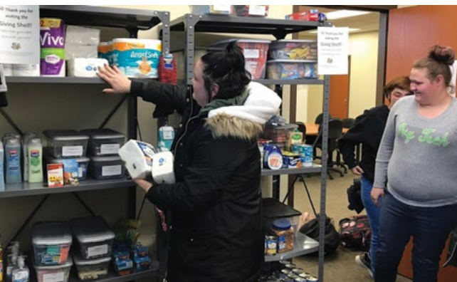
Ivy Tech Community College in Kokomo offers a "Giving Shelf" with non-perishable food items, paper products and school supplies for students.