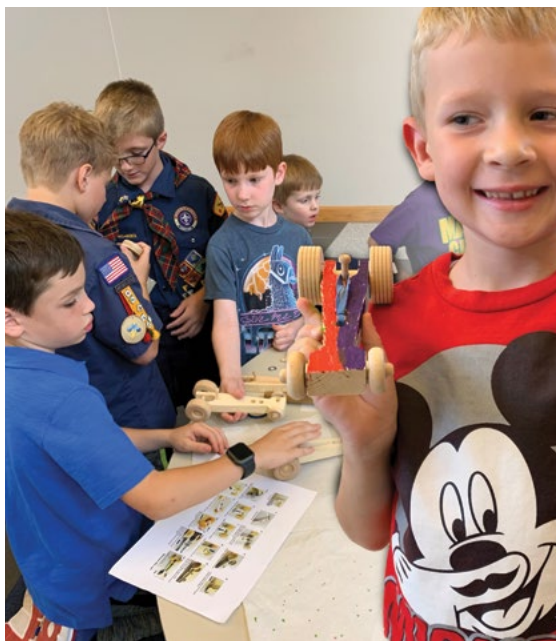
✂ Kokomo Cub Scouts enjoyed building rubber-band powered model cars in the "Membership Recruiting" project with the Boy Scouts of America, Sagamore Council.